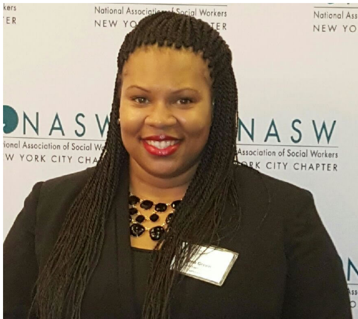
NASW MID-CAREER EXEMPLARY LEADER AWARD