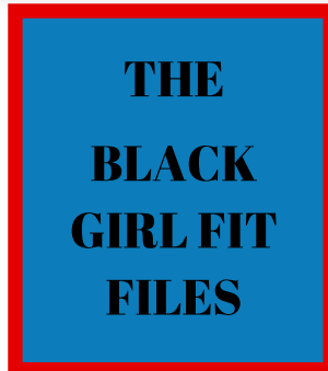
Black Girls Pole EPISODE 18: DO I NEED A THERAPIST?