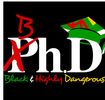
Black & Highly Dangerous EPISODE 90: BLACK FATHERHOOD