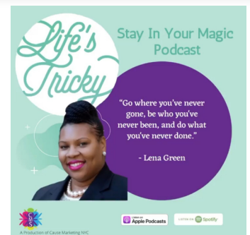
Life's Tricky Podcast CAUSE MARKETING SUMMIT