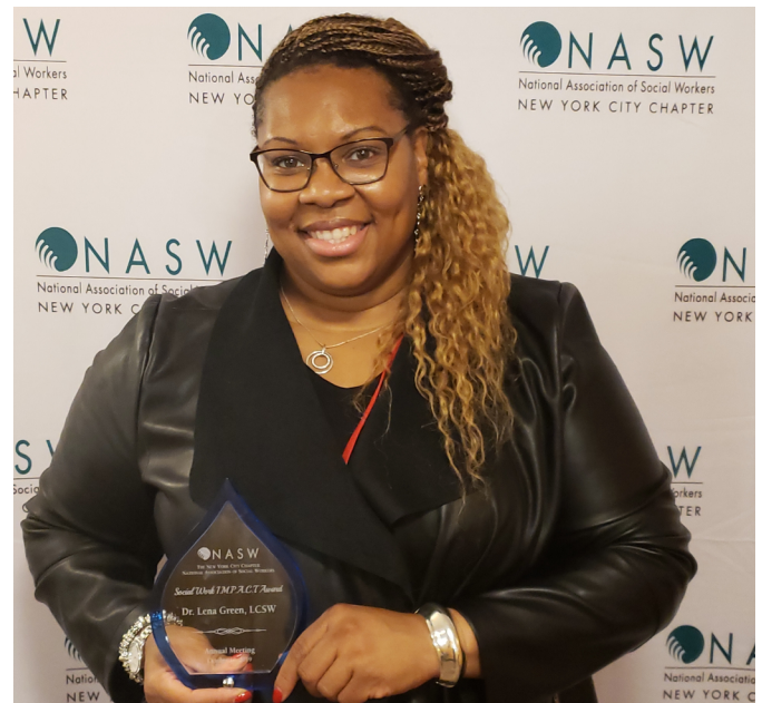
I.M.P.A.C.T. AWARD NASW-NYC'S HIGHEST HONOR